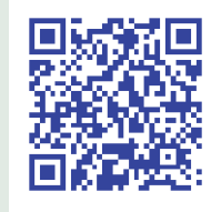
iOS QR Code

Make Sure to Download Our Mobile App “AGC NYS” for Up-to-Date Conference Information