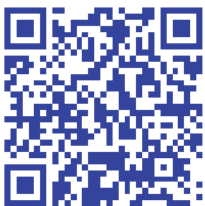
iOS QR Code

Download Our Mobile App "AGC NYS" for Up-to-Date Conference Information and