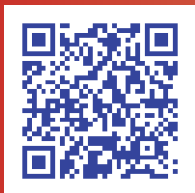
iOS QR Code

To qualify, simply download the app, click on the scrolling iPad promotion, enter your information, and submit via the online feature.