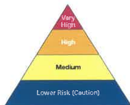
Occupational Risk Pyramid for COVID-19

Worker risk of occupational exposure to SARS-CoV-2, the virus that causes COVID-19, during an outbreak may vary from very high to high, medium, or lower (caution) risk. The level of risk depends in part on the industry type, need for contact within 6 feet of people known to be, or suspected of being, infected with SARS-CoV-2, or requirement for repeated or extended contact with persons known to be, or suspected of being, infected with SARS-CoV-2. To help employers determine appropriate precautions, OSHA has divided job tasks into four risk exposure levels: very high, high, medium, and lower risk. The Occupational Risk Pyramid shows the four exposure risk levels in the shape of a pyramid to represent probable distribution of risk. Most American workers will likely fall in the lower exposure risk (caution) or medium exposure risk levels.